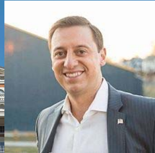
Senator Joseph Boncore